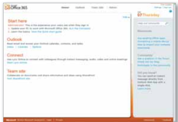
The user's home page for Office 365 for small businesses