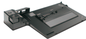
ThinkPad Port Replicator Series 3 (4336-10W) ThinkPad Mini Dock Series 3 (45N66xx) ThinkPad Mini Dock Series 3 (45N669x) ThinkPad Mini Dock Plus Series 3 (4338-10U)