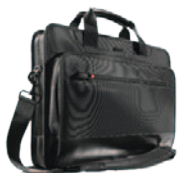
ThinkPad Business Topload Case (43R2476) ThinkPad Business Backpack (43R2482) Wenger Backpack for Lenovo (57Y4271) Wenger Deluxe Slim Case for Lenovo (57Y4272)