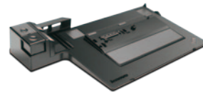
(4336-10W) ThinkPad Port Replicator Series 3 (45N66xx) ThinkPad Mini Dock Series 3 (54N669) ThinkPad Mini Dock Plus Series 3