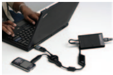
Lenovo 90W Ultraslim AC/DC Combo Adapter (41R44xx)