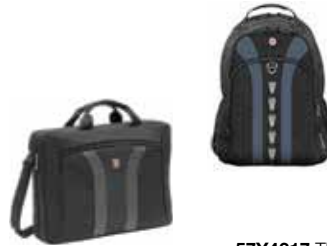
57Y4317 ThinkPad Business Topload Case 43R2482 ThinkPad Business Backpack 57Y4271 Wenger Backpack for Lenovo 57Y4272 Wenger Deluxe Slim Case for Lenovo