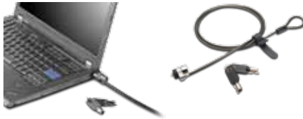
73P2582 Kensington Microsaver Security Cable Lock by Lenovo 45K1620 Kensington Twin Head Cable Lock from Lenovo