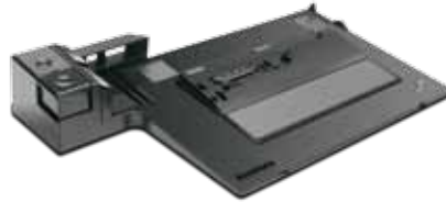
4336-10W ThinkPad Port Replicator Series 3 45N66xx ThinkPad Mini Dock Series 3 45N669x ThinkPad Mini Dock Plus Series 3