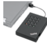
THINKPAD USB PORTABLE SECURE HARD DRIVE 43R2018 – 160GB 43R2019 – 320GB 57Y4400 – 500GB