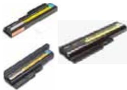
57Y4185 ThinkPad Battery 55+ 57Y4186 ThinkPad Battery 55++