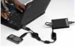
41R4xxx Lenovo 90W Ultraslim AC/DC Combo Adapter